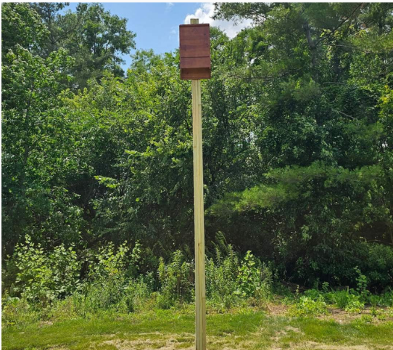
New bat houses can be seen throughout the park!